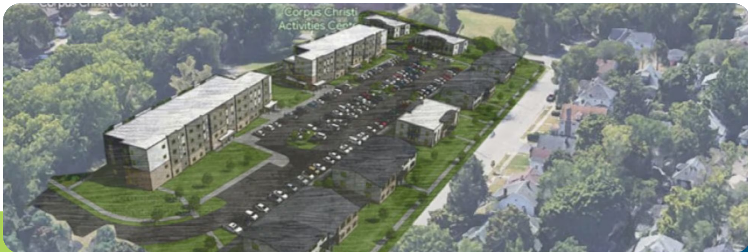
HōM Flats - 325 Homewood Ave, Dayton 45405

Perhaps the least understood of our financial tools, CityWide's CDFI status unlocks access to some of our most well-known lending programs. The primary mission of CDFIs is to promote economic development by providing financial products and services to people and communities underserved by traditional financial institutions. CDFIs are U.S. Department of Treasury certified organizations that lend at affordable rates and terms in underserved markets. CDFIs finance affordable housing, small businesses, non-profit organizations, and commercial real estate to stabilize and revitalize neighborhoods and cities. CityWide Development Corporation is a CDFI through its subsidiary, Dayton Region New Market Fund (DRNMF). Projects in 2025 included: