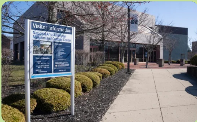
National Afro-American Museum and Cultural Center