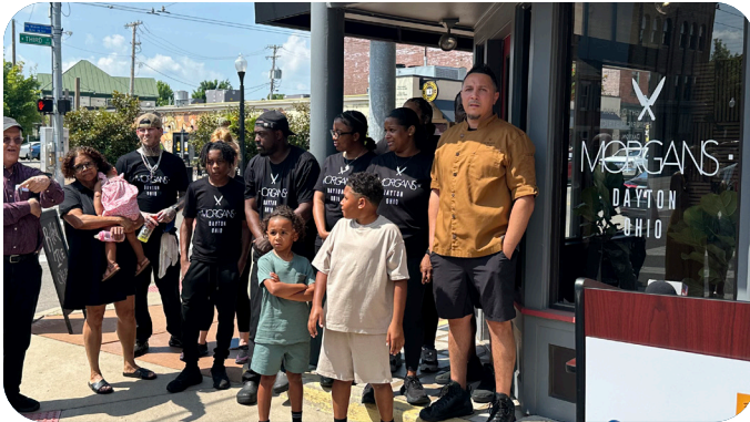
Morgan's – 1101 W Third St, 45402