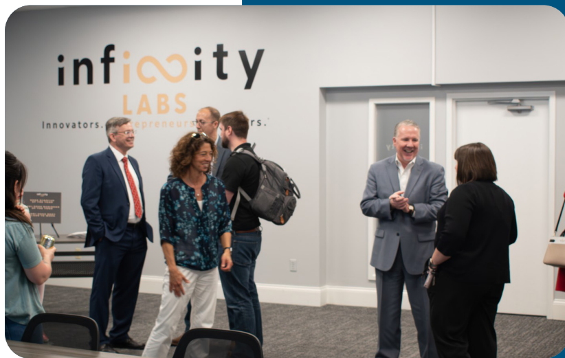
Infinity Labs - Downtown Dayton 45402