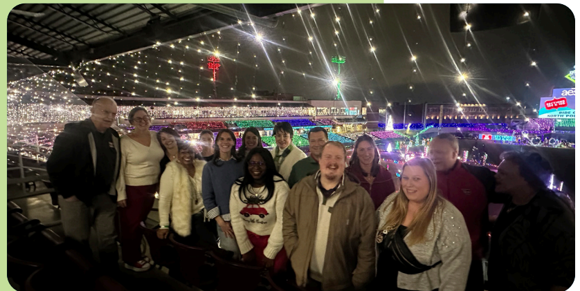
Deck the Diamond at Day Air Ballpark