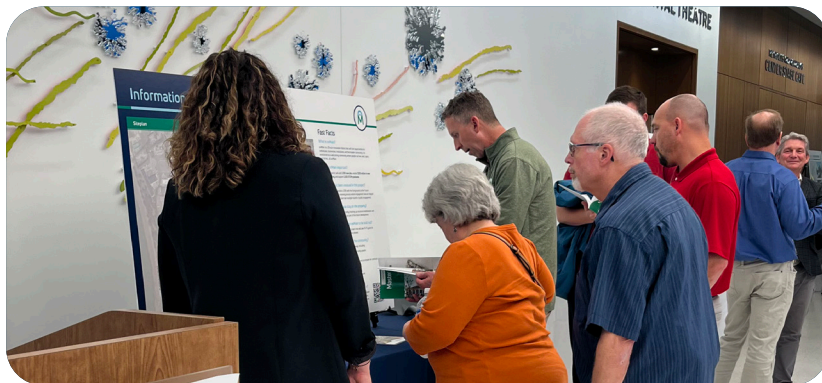
onMain - Corner of Stewart and Main Streets, Dayton 45409