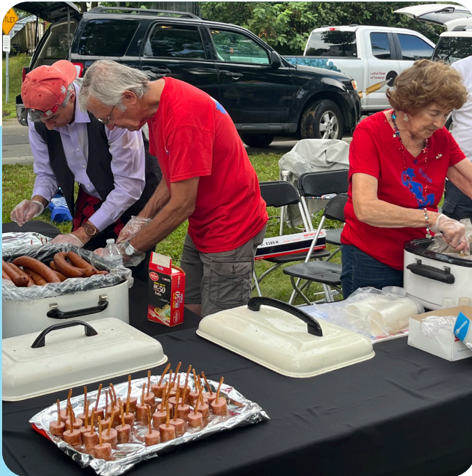
Sticking with tradition, CityWide had a table at Old North Dayton's National Night Out event. The heavily attended event features free food and entertainment from a variety of cultures.