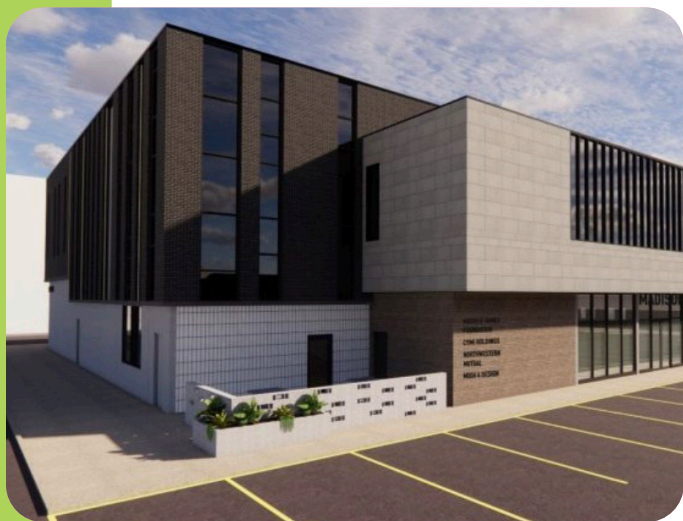
Office space redevelopment in partnership with Woodard and City of Dayton - 431 E. Third St, Dayton 45402