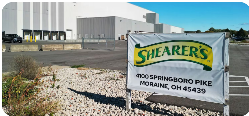
Shearer's Foods - 4100 N Springboro Pike, Moraine 45439