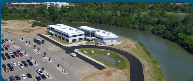
CRG – 8821 Washington Church Rd, Miamisburg 45342