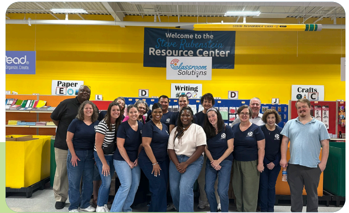
Crayons to Classrooms