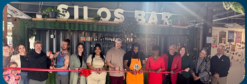
The Silos - 810 E First St, Dayton 45402 45342