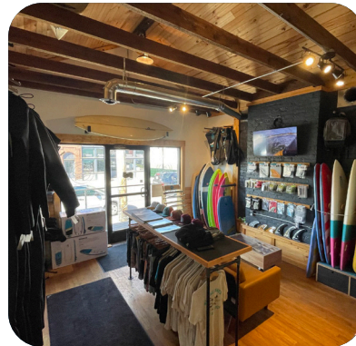
Eddy Out – 120 Valley St, Dayton 45404