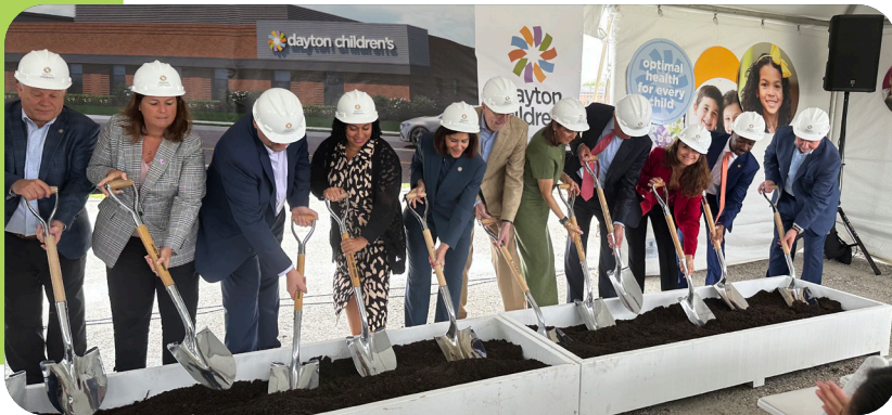
Dayton Children's Hospital pediatric urgent care - 1711 Germantown Street, Dayton 45417

In addition to its CDFI status, DRNMF hold a Community Development Entity designation from the U.S. Department of Treasury. This designation allows CityWide to apply for New Markets Tax Credits (NMTCs). The NMTC Program aims to break the cycle of disinvestment by attracting the private capital necessary to reinvigorate struggling local economies. These high-impact investments can be a lifeline for communities facing significant vacancy in commercial properties and lack of access to important resources such as grocery stores and healthcare while also driving job growth for the area. Projects in 2025 included: