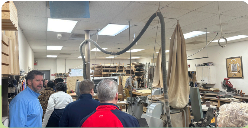
We Care Arts

CityWide staff took time in 2025 to visit new places and volunteer together. Staff even got to celebrate the holidays at the new Deck the Diamond event! Check out where we went this year: