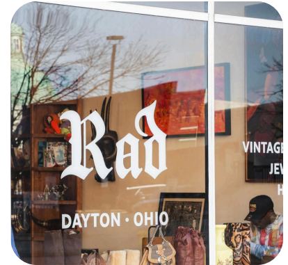
Rad Vintage – 116 W 5 th St, Dayton 45402