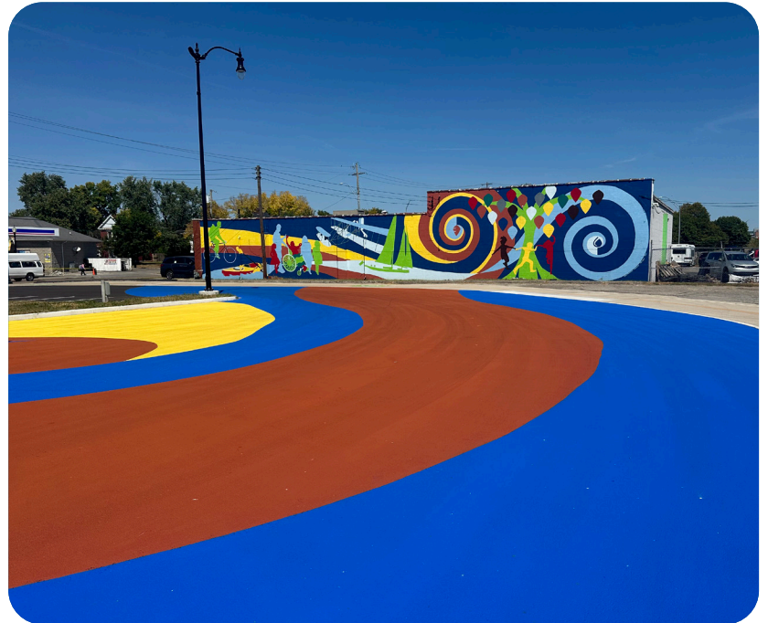
Another phase of Point Park was completed in 2025! This space was once a gravel lot that was rarely used. Sandwiched between Eddy Out and Mobility Works (where CityWide painted a mural a few years back), this reimagined space is ready for almost anything. It's designed to be flexible for food truck events, festivals, or just a place to hang out and catch a view of downtown.