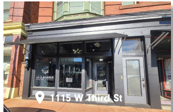
1115 W Third St