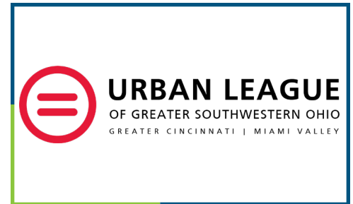
Dayton Bike Yard Community Bike Fund