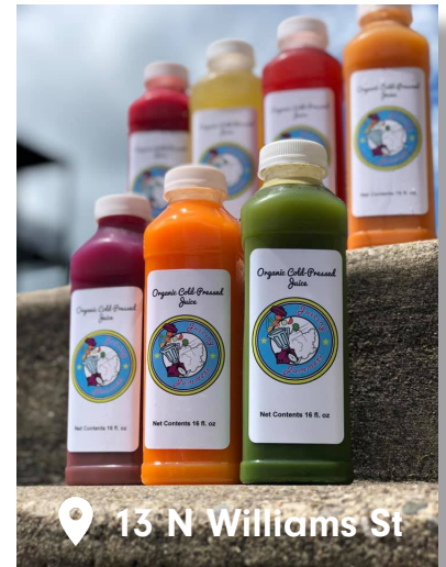
13 N Williams St