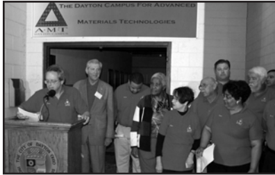
Dignitaries and the DC-AMT team celebrate the ribbon-cutting.

CityWide Development Corporation 8 North Main Street Dayton OH 45402 937.226.0457 www.citywidedev.com